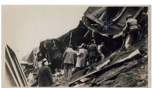
Rescue workers sifting through the wreckage of overturned cars.