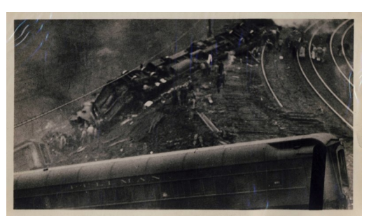
Overturned passenger cars on the curve. www.tunnelhillboro.com