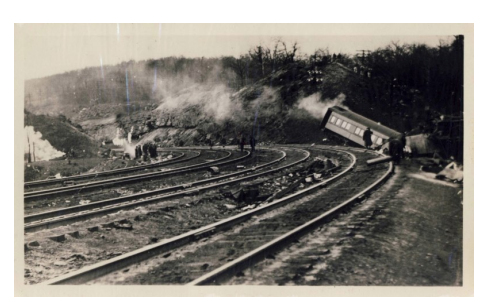
Looking into the curve with wreckage on the right.