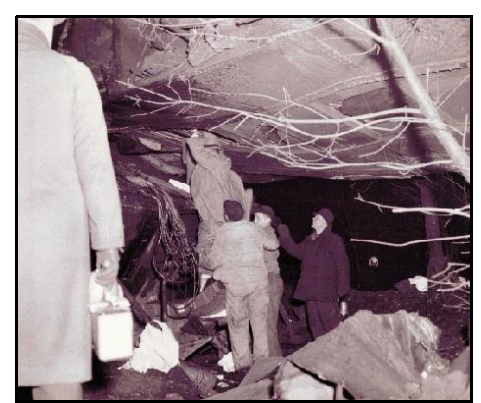
Three rescuers lower a minister out of an overturned car at the bottom of the ravine

Men with acetylene torches were cutting into the cars to help extricate the passengers. Others lay on the ground dead and people were trying to render aid to the injured.