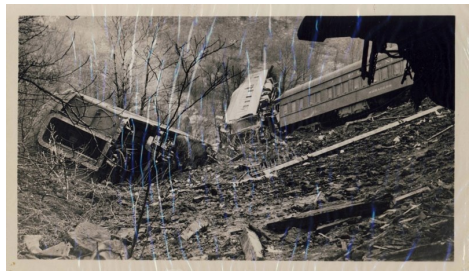
Looking down into the ravine. www.tunnelhillboro.com