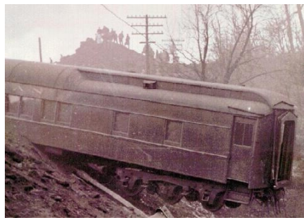
A passenger car hanging over the rim of the curve.