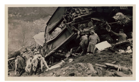
Rescue workers searching overturned equipment on the side of the ravine.