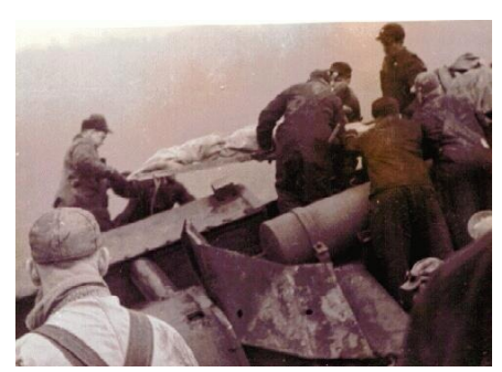
Rescue workers passing a stretcher atop the overturned railcars.