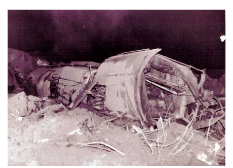
K4s locomotive facing up the steep incline Altoona Railroaders Memorial Museum