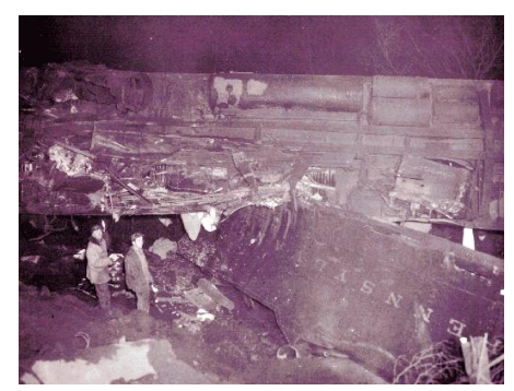
Overturned tender from one of the K4s locomotives at the bottom of the ravine.