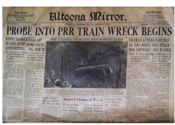
Altoona Mirror Newspaper Wednesday Evening, February 19, 1947