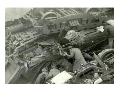
Workers looking inside twisted wreckage for possible survivors or victims.