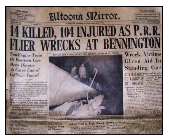
Altoona Mirror Newspaper Tuesday Evening, February 18, 1947