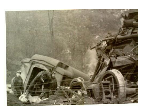
Closeup of workers among the wreckage.