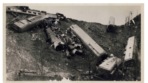
Wreckage viewed from the bottom of the ravine shows overturned mail car, locomotive and passenger cars.