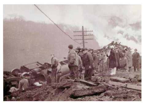
View from the top looking over the edge of the wreck scene. Nurses are at the right of the photo.