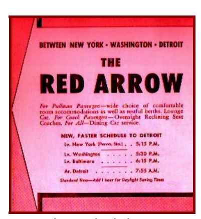
Pennsylvania Railroad Advertisement for westbound "The Red Arrow" - 1949