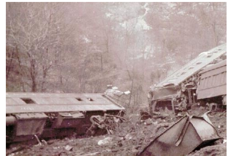
Top view looking down the ravine at the overturned cars. Grea Sheets - Altoona Archive