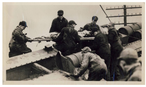
Rescue workers passing a stretcher atop the overturned railcars. www.tunnelhillboro.com