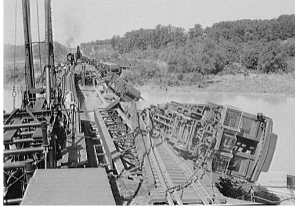
WRECK OF THE CRESCENT LIMITED ON THE ANACOSTIA RIVER BRIDGE August 24, 1933.

At the same time the fast express train, The Crescent Limited, had left New York and was speeding towards Washington's Union Station and then after a layover in Washington it would continue to its eventual destination of New Orleans. When the train left Baltimore the engineer was handed an advisory telling him about high water and as a result, he reduced his speed to thirty miles an hour as he approached the city.