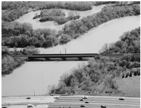
LOOKING SOUTH AT THE AMTRAK ANACOSTIA RIVER BRIDGE WITH THE NEW YORK AVENUE BRIDGE IN THE FOREGROUND - 1977.

"How any of us got out is more than I can understand. I was in the coach that broke through the trestle and dropped into the water. My first recollection is of standing on the window of my berth hanging from the curtain rod. We (the man in the next berth) heard water rushing all around us. The porter eventually opened the window and they escaped."