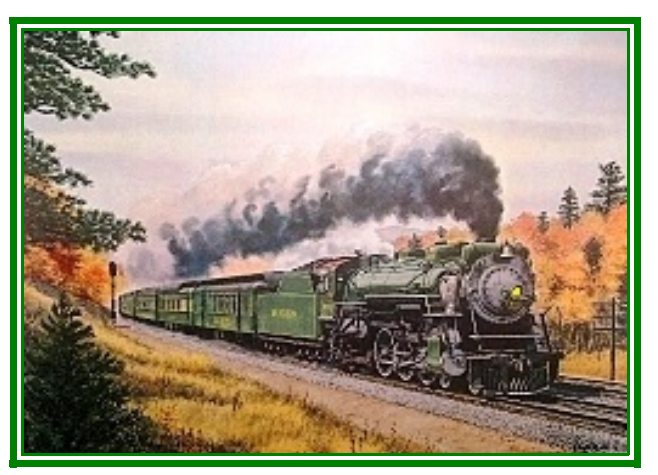
PAINTING BY HOWARD FOGG DEPICTING THE SOUTHERN RAILWAY'S CRESCENT LIMITED AT SPEED, POWERED BY PS-4 No. 1401.

[Article from Ghosts of DC and Wikipedia]