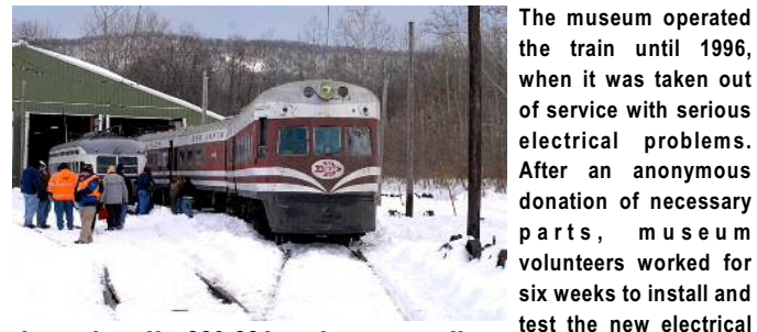
LIBERTY LINER NO. 803-804, THE INDEPENDENCE HALL, AT ROCKHILL FURNACE, PA. ON FEB 15, 2014.

trains has returned to operation following major repairs to its electrical control systems by museum volunteers. The train is at the Rockhill Trolley Museum in Rockhill Furnace, adjacent to the narrow gauge East Broad Top Railroad.