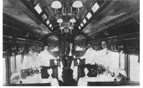
B&O PUBLICITY PHOTO OF THE ROYAL BLUE DINING CAR QUEEN IN 1895. REPRINTED IN THE APRIL 1940 BALTIMORE & OHIO MAGAZINE.

Even before the Baltimore Belt Line project was finished, the B&O launched its Royal Blue service on July 31, 1890. Powered by 4-6-0 steam locomotives having exceptionally large 78-inch (198 cm) diameter driving wheels for speed, the Royal Blue trains occasionally reached 90 mph (145 km/h). After the Baltimore Belt Line project was completed, travel time between New York and Washington was reduced to five hours, compared to nine hours in the late 1860s.