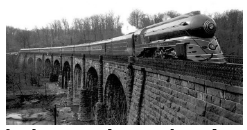
ROYAL BLUE POWERED BY A PRESIDENT-CLASS PACIFIC ON THOMAS VIADUCT, SOUTH OF BALTIMORE, IN A POSED 1937 PUBLICITY PHOTO.

The B&O was not entirely satisfied with the ride quality of the lightweight Royal Blue train, however, and replaced it on April 25, 1937, with streamlined, refurbished heavyweight equipment, painted light gray and royal blue with gold striping, designed by Otto Kuhler. The train was pulled by the first streamlined diesel locomotive, B&O # 51, the 3,600 h.p. EMC EA/EB model built by Electro Motive Company. Praised for its beauty and handsome profile, this first streamlined production model diesel "dazzled the press and public", said one magazine writer of the groundbreaking locomotive's introduction. Kuhler also streamlined one of B&O's 4-6-2 "Pacific" steam locomotives for use on the Royal Blue. Its bullet-shaped shroud became an iconic image for the Royal Blue and was modeled for years by American Flyer. Time magazine, in reporting on the precarious financial condition of the Baltimore and Ohio Railroad and other Depression-ravaged rail lines in 1937, referred to the B&O's "swashbuckling" Royal Blue streamliner launched that year as having "symbolized the new era in railroading ..."