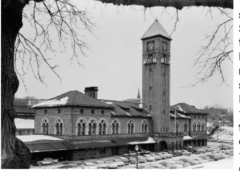
MOUNT ROYAL STATION, BUILT BY THE B&O IN 1896. PASSENGER TRAIN SERVICE CEASED IN 1961 AND THE STATION WAS ACQUIRED BY THE MARYLAND INSTITUTE COLLEGE OF ART.

long tunnel under the middle of Baltimore, the B&O pioneered the first mainline electrification of a U.S. railroad, installing an overhead third rail system in the tunnel and its approaches. An electric locomotive first pulled a Royal Blue train through the Howard Street tunnel on June 27, 1895.