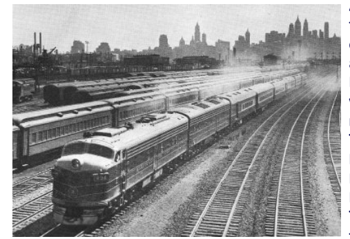
FINAL SOUTHBOUND RUN OF THE ROYAL BLUE, TRAIN NO. 27, SHOWN DEPARTING JERSEY CITY, NEW JERSEY ON SATURDAY MORNING APRIL 26, 1958.

Although all of B&O's Washington–Jersey City passenger trains had been fully dieselized by September 28, 1947, no new passenger cars were built for the Royal Blue in the postwar period. The refurbished 8-car 1937 Royal Blue trainset continued in operation to the end. The overwhelming market dominance of the Pennsylvania Railroad was evident when it introduced the 18-car stainless steel Morning Congressional and Afternoon Congressional streamliners in 1952. By the late 1950s, most U.S. passenger trains suffered a steep decline in patronage as the traveling public abandoned trains in favor of airplanes and automobiles, utilizing improved Interstate Highways. The Royal Blue was no exception, as operating deficits approached $5 million annually and passenger volume declined by almost half between 1946 and 1957. Amidst the downward trend, the Royal Blue Line briefly recaptured the regal splendor of its early years on October 21, 1957, when Queen Elizabeth II and Prince Philip traveled on the B&O from Washington to New York.