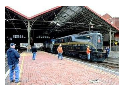
PRR No. 4859 BEGINS HER JOURNEY AT HARRISBURG - APRIL 5, 2014