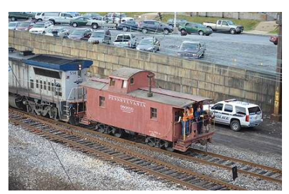
PRR No. 980016, A CLASS N6B CABIN, MOVES TO ITS TEMPORARY HOME - APRIL 5, 2014