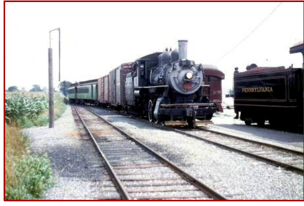
STRASBURG RAIL ROAD NO. 31 ARRIVING IN STRASBURG, PA. WITH AN HONEST-TO-GOODNESS MIXED TRAIN IN AUGUST 1963

Please purchase your ticket from the Lancaster Chapter at the discounted price of $5.00. Regular coach price is $14.00 at the Strasburg Rail Road Ticket Office.