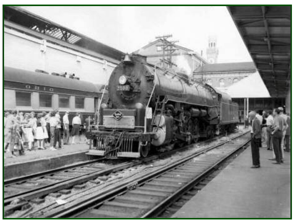
READING T1 No. 2100 PREPS FOR AN IRON HORSE RAMBLE ON THE B&O, CAMDEN STATION, BALTIMORE - AUGUST 15, 1964 PHOTOGRAPHER UNKNOWN BALTIMORE CHAPTER, NRHS COLLECTION.