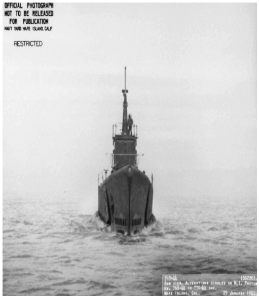
BOW VIEW OF THE U.S.S. BARB

Patience Bay was wearing thin the patience of Commander Fluckey and his innovative crew. Everything was ready. In the four days the saboteurs had anxiously watched the skies for cloud cover, the inventive crew of the Barb had built their microswitch. When the need was posed for a pick and shovel to bury the explosive charge and batteries, the Barb's engineers had cut up steel plates in the lower flats of an engine room, then bent and welded them to create the needed tools. The only things beyond their control was the weather....and time. Only five days remained in the Barb's patrol.