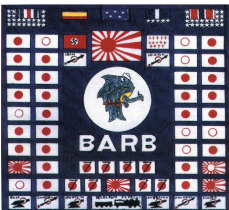
Final World War II Battle Flag of USS Barb (SS-220)

This raid is represented by the train symbol in the middle bottom of the battle flag.