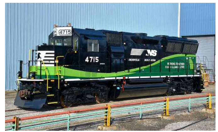
NORFOLK SOUTHERN GP33ECO NO. 4715 AT THE JUNIATA LOCOMOTIVE SHOP IN ALTOONA, PA.

Congestion Mitigation and Air Quality (CMAQ) Improvement Program have been released for road testing by Norfolk Southern from its Juniata Locomotive Shop in Altoona, Pa.