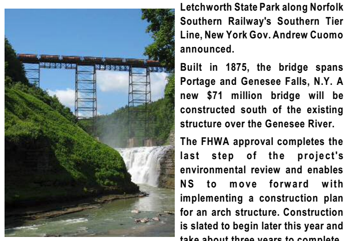
PRESENT PORTAGEVILLE BRIDGE

The Federal Highway Administration (FHWA) has issued a record of decision for the design and construction of a new Portageville Bridge in