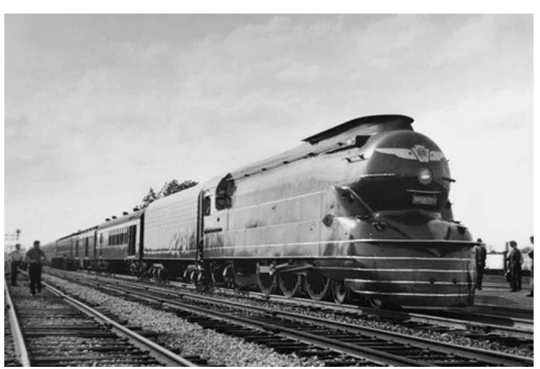
It's June 15, 1938, the date on which the Pennsylvania Railroad's Broadway Limited MADE ITS DEBUT AS A STREAMLINED TRAIN. K4S No. 3768, GIVEN A STREAMLINED COWLING TWO YEARS PREVIOUSLY, HANDLED THE TRAIN OUT OF CHICAGO