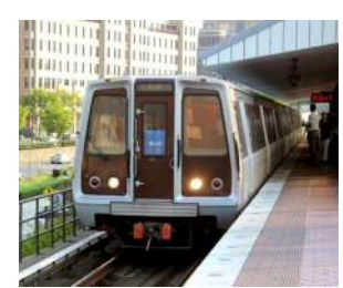
WMATA 4000-SERIES CAR AT THE KING STREET STATION PLATFORM IN 2005

In November 2016, Metro downgraded the 4000-series cars from leading trains after problems occurred with the cars' automatic train control technology.