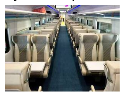
BRIGHTLINE "SMART" COACH

travel, a new travel alternative as an option to private cars on crowded roads."Innovations abound with Brightline, beginning with boarding. Brightline is the first fully accessible train, exceeding ADA compliance standards and providing effortless access from end-to-end. To do this, Brightline trains feature level boarding and utilize automated retractable platforms that are integrated into the train car door systems. Prior to the doors' opening, the platforms extend up to 12 inches from the train and pivot to create a flush surface for passengers to cross from platform to train, making it easy for those with mobility challenges, pushing strollers or rolling luggage to board. Brightline's interior aisles are 32 inches, wider than any other train, providing ample space for wheelchairs and strollers to easily glide throughout the coach with access to all areas, including the restrooms. Interior vestibule doors also slide open and close automatically, so guests can seamlessly move between coaches.