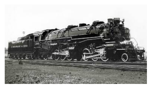
C&O No. 1309 Builder's PHOTO

CUMBERLAND, Md. — Western Maryland Scenic Railroad officials surprised the railway preservation community today by announcing that tickets are on sale to ride behind Chesapeake & Ohio 2-6-6-2 No. 1309 during the July 4th weekend.