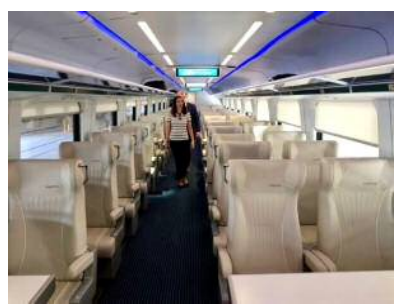
BRIGHTLINE "SELECT" COACH PHOTO - ALAN GOMEZ

On each trainset, there is one Select and three Smart coaches. With both options, riders can reserve specific seats when booking tickets through Brightline's mobile application, website or station kiosks. Each product will offer a range of amenities and pricing. Riders will also be able to add additional items, such as parking and ground transportation to their booking to further complete their travel experience, making it connected from door to destination. In the Select coach, the custom-designed ergonomic leather seats are 21 inches wide and, in the Smart coach, the seats are 19 inches wide, both wider than most other transit seats, with in-seat recline, sliding down and back so not to compromise legroom of fellow passengers. The Select coach features 49 seats