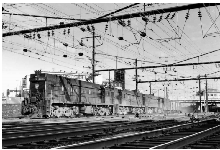
PRR 4439 PASSES THE PRR STATION IN BALTIMORE WITH A SOUTHBOUND FREIGHT IN MARCH 1966. GE BUILT 66 E44 C-C ROAD-SWITCHERS DURING 1960—63 USING THE RECTIFIER TECHNOLOGY PROVEN BY THE BALDWIN-WESTINGHOUSE CAB UNITS.