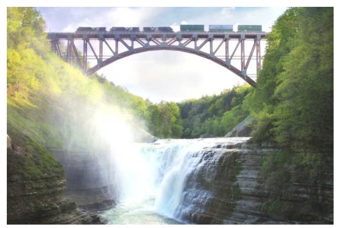
GENESEE ARCH BRIDGE

Surrounded by scenic Letchworth State Park, the $75-million bridge expands freight rail capacity and economic opportunities for businesses and communities across the Southern Tier and Finger Lakes. Constructed through a public-private partnership, the single-track arch structure replaced a 19th-century-era bridge that restricted train speeds and rail car weights and had become a major transportation bottleneck.