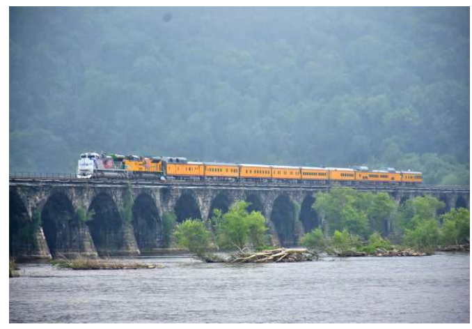
NORFOLK SOUTHERN TRAIN 066 WITH UNION PACIFIC OCS ON ROCKVILLE BRIDGE, HARRISBURG, PA., MAY 31, 2018 - PHOTO COURTESY OF SD40GMA.

At Proviso, UP removed No. 2752 from the train, which continued east from Chicago as Norfolk Southern train 066-30. It's expected to return west from Croxton on June 4 to Council Bluffs.