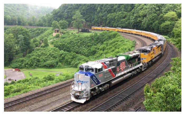
NORFOLK SOUTHERN TRAIN 066 ROUNDS HORSESHOE CURVE WITH UNION PACIFIC RAILROAD'S OFFICE CAR TRAIN, LED BY THE "SPIRIT OF THE UNION PACIFIC", SD70ACE #1943 ON MAY 31, 2018, HEADING FOR AN EVENT IN HARRIMAN, NY - NORFOLK SOUTHERN PHOTO.

close to the railroad, arriving in Proviso Yard in the Chicago area around lunchtime. The train was powered by ES44AH No. 2752 and SD70AH's Nos. 1943 and 9082 from Council Bluffs to Chicago where it was handed over to Norfolk Southern for the balance of the trip.